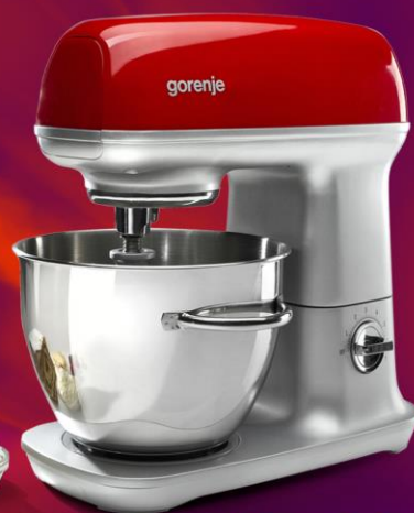
MMC1000 RLR Kitchen machine